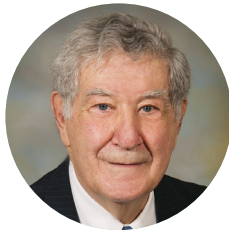
HONORABLE LOU D'ALLESANDRO